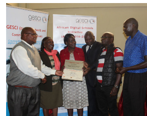
School management team from Rungiri Secondary School in Kenya receive their e-Confident Award.

80 secondary schools drawn from 4 counties in Kenya were awarded e-Confident status under the African Digital Schools Initiative (ADSI) programme being implemented in the County. The programme leads schools through 4 stages of whole school digitization from e-Initial to e-Enabled to e-Confident and, finally, to e-Mature. When the participating schools reach e-Mature stage, they will be classified as Digital Schools of Distinction . The school principals received certification in recognition of their lead roles in supporting their teachers to utilize and integrate digital technologies in their teaching. The programme has the enthusiastic support of the county education authorities, the Teachers Service Commission as well as the schools' boards of managements and parents' associations. The African Digital Schools Initiative (ADSI) Programme is funded by Mastercard Foundation, Canada. For further information contact: esther.wachira@gesci.org