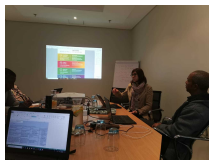
Participants at the EMIS training

GESCI facilitated the training of government officials from the Ministries of Basic and Senior Secondary Education and Technical and Higher Education over a two-week period in Cape Town South Africa. The first week focused on EMIS and the second week the group split between GIS and M&E training with a focus on applications for their sector contexts. For further information contact: angela.arnott@gesci.org