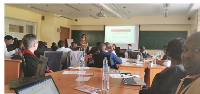
Participants at the TEA-LP workshop in Nairobi.