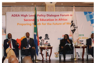
Participants at the policy dialogue forum