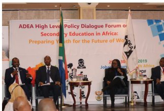
Participants at the policy dialogue forum

The Association for the Development of Education in Africa (ADEA) and the Ministry of Basic Education of South Africa, with the support of the MasterCard Foundation, co-hosted this High-Level Annual Policy Dialogue Forum on Secondary Education in Africa. GESCI presented on its African Digital Schools Initiative which seeks to transform secondary schools into Digital Schools of Distinction. The forum seeks to share understanding of mechanisms for leveraging secondary education to better empower African youths to contribute effectively to the socio-economic transformation of their respective countries. The Forum provided an opportunity for review and discussion on the findings and recommendations of the Mastercard Foundation report, " Secondary Education in Africa: Preparing Youth for the Future of Work. " For further information contact: angela.arnott@gesci.org