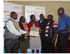
School management team from Rungiri Secondary School in Kenya receive their e-Confident Award.

80 secondary schools drawn from 4 counties in Kenya were awarded e-Confident status under the African Digital Schools Initiative (ADSI) programme being implemented in the County. The programme leads schools through 4 stages of whole school digitization from e-Initial to e-Enabled to e-Confident and, finally, to e-Mature. When the participating schools reach e-Mature stage, they will be classified as Digital Schools of Distinction . The school principals received certification in recognition of their lead roles in supporting their teachers to utilize and integrate digital technologies in their teaching. The programme has the enthusiastic support of the county education authorities, the Teachers Service Commission as well as the schools' boards of managements and parents' associations. The African Digital Schools Initiative (ADSI) Programme is funded by Mastercard Foundation, Canada. For further information contact: esther.wachira@gesci.org