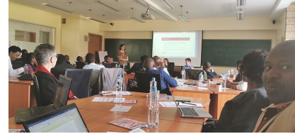
Participants at the TEA-LP workshop in Nairobi.