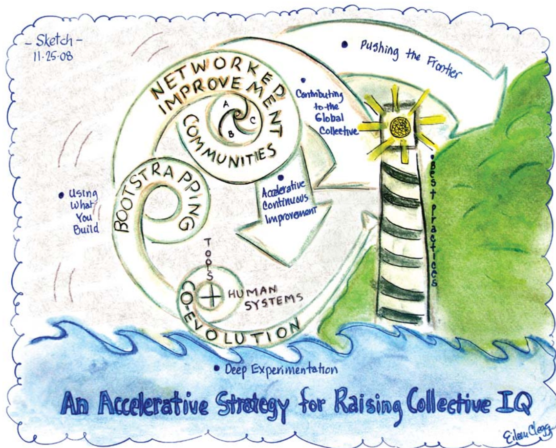
Figure 2: Conceptual rendering of Douglas Engelbart's augmentation cycle